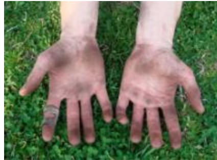
Contact with contaminated hands/ clothes