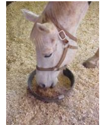
Contaminated feed supply