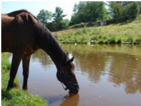
Contaminated water supply