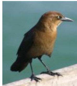
Ingestion of faeces of mice/birds