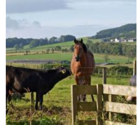
Contact with shedding livestock/ horses